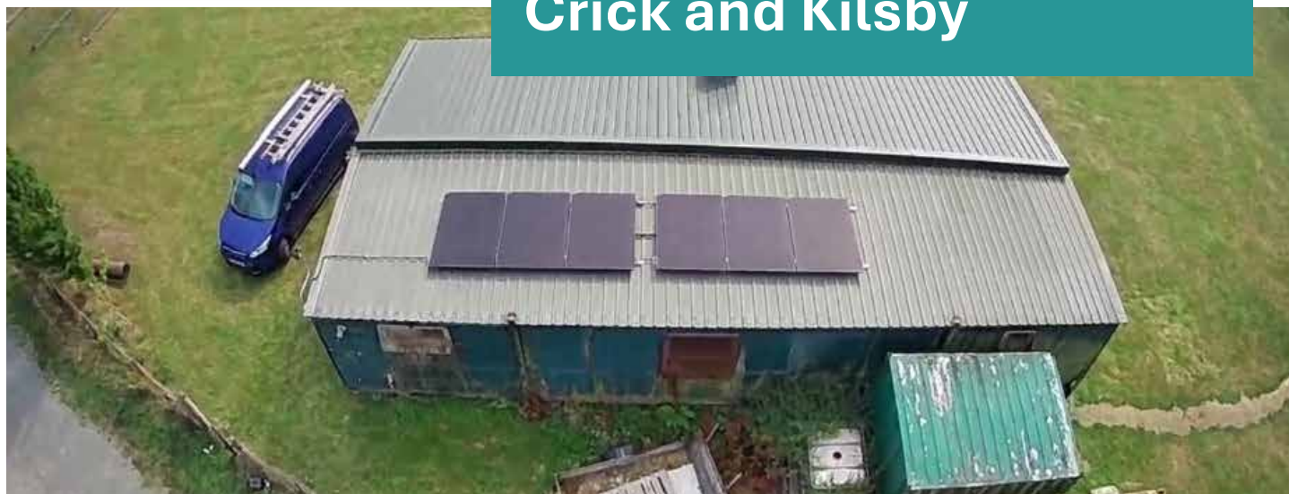
▲ Crick Lions Cricket Club: Pavilion Solar Panel, Battery, & Solar Floodlight Installation, completed Sept 2025