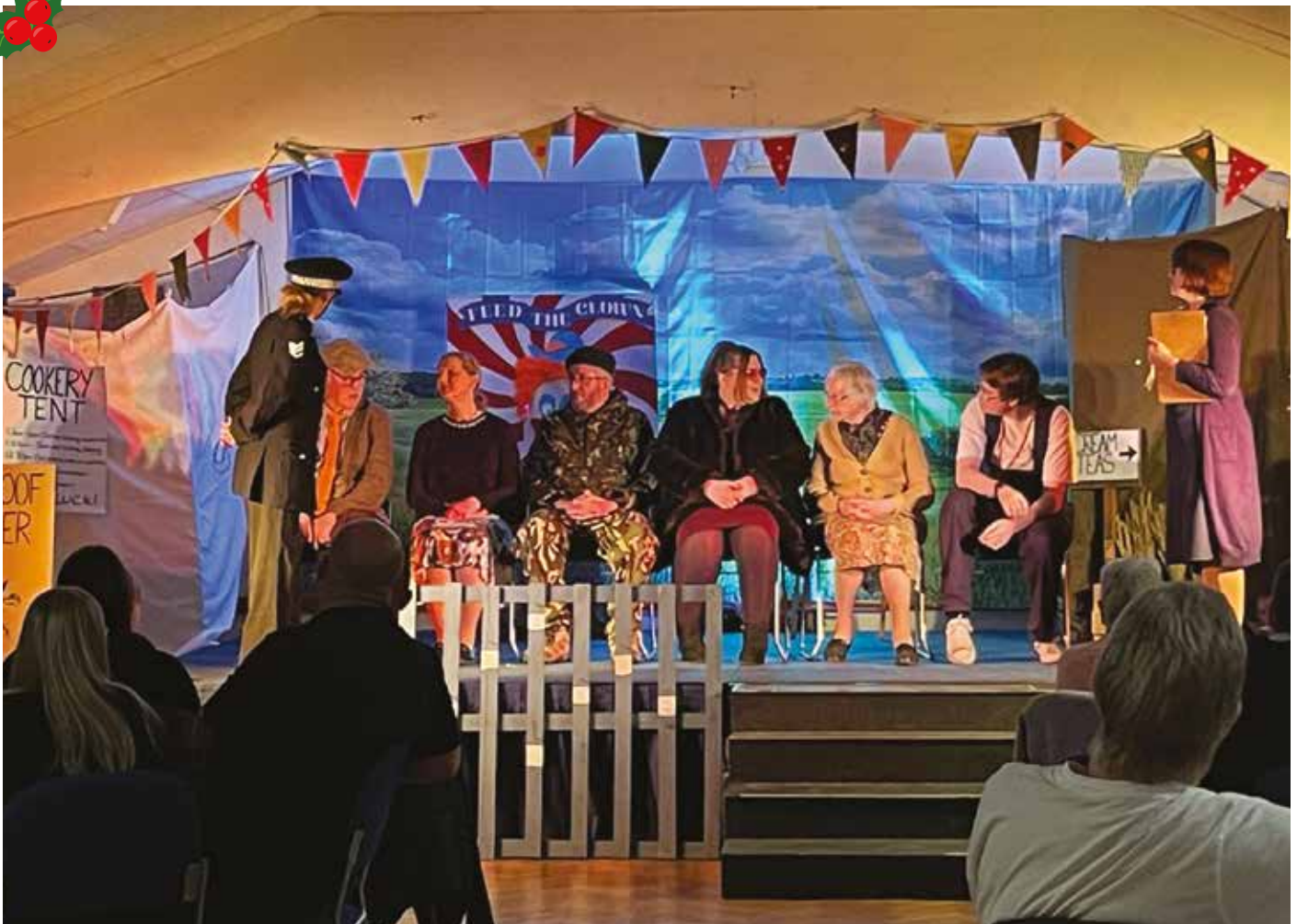
The Kilsby Players in action.

Edition no. 166. December 2025 - January 2026