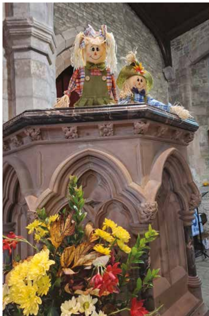
Photo from our Harvest Festival